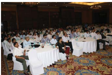
View of Delegates