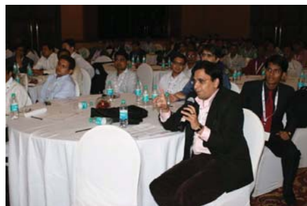
Q & A round